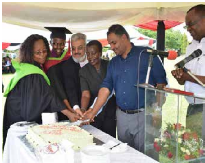
Mombasa, Kenya - 14 th EACFFPC Graduation Ceremony - 2017