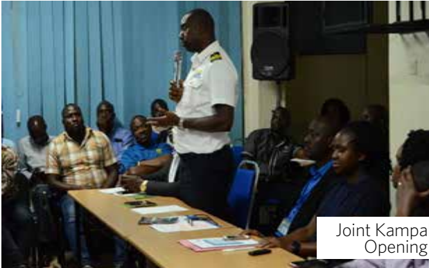
Joint Kampala and Entebbe Opening Ceremony