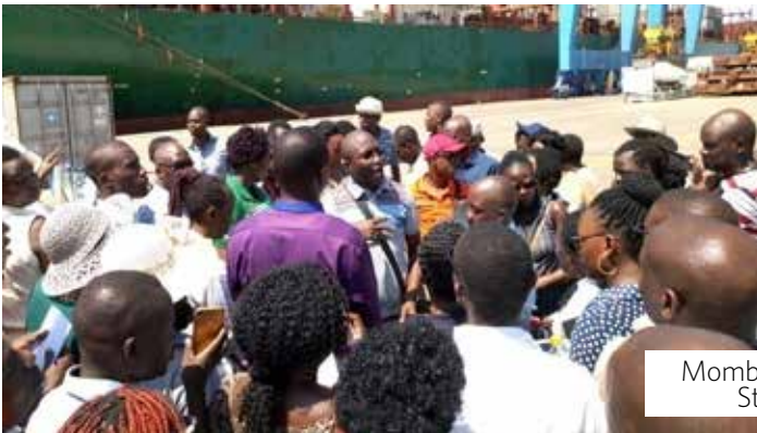
Mombasa Field Study