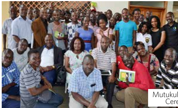
Mutukula Opening Ceremony